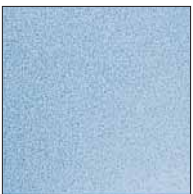
Blue Mountain (BT)