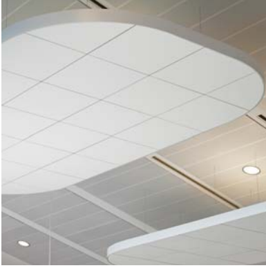
PRODUCT: Formations® Curves LOCATION: The Reading Room, Lancaster, PA