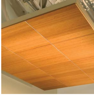
PRODUCT: WoodWorks® Bamboo with Axiom® Perimeter Trim LOCATION: The Avenue, Lancaster, PA