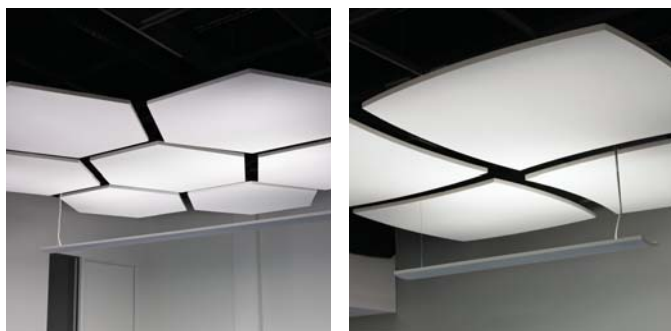
Available Fall 2007

There's never been a more visually stunning way to control unwanted noise. Pre-curved SoundScapes Acoustical Canopies can be used individually or grouped together in a variety of creative configurations to make a dramatic statement. With SoundScapes, you'll truly appreciate the beauty of quietude.