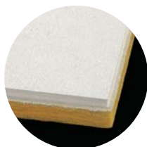
Optima Square Tegular