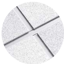
Optima Square Tegular Edge with Suprafine 15mm Exposed Tee Grid