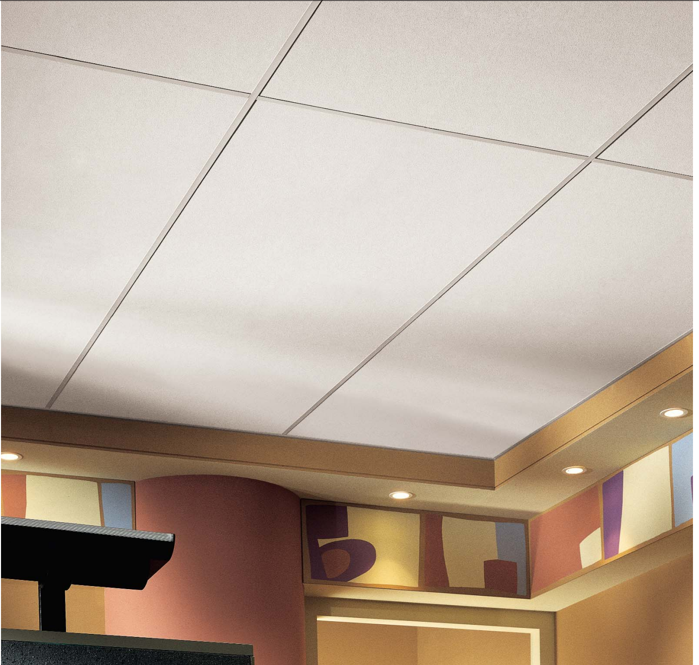
Optima Open Plan Square Lay-in with Peakform 24mm Exposed Tee grid