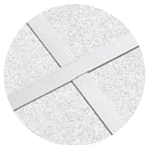
Optima Square Edge with Peakform 24mm Exposed Tee Grid