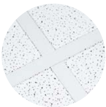
FINE FISSURED Ceramaguard with PeakForm 24mm Exposed Tee grid