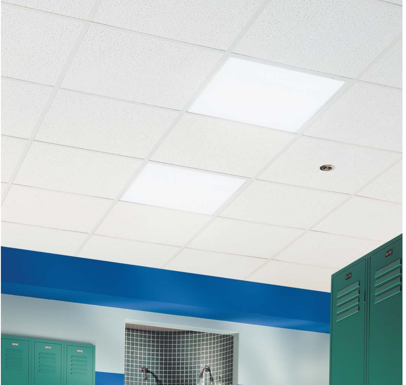
FINE FISSURED Ceramaguard with PeakForm 24mm Exposed Tee grid