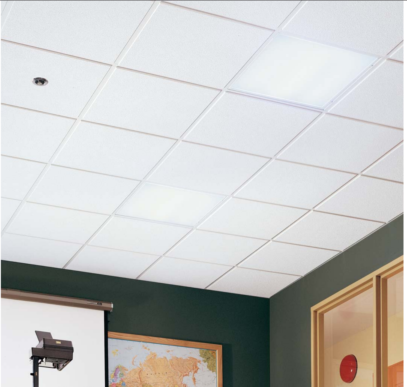
TEXTURA Beveled Tegular with PeakForm 24mm Exposed Tee Grid