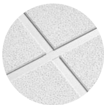
TEXTURA Tegular Edge with PeakForm 24mm Exposed Tee Grid