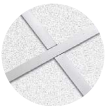
TEXTURA Square Edge with PeakForm 24mm Exposed Tee Grid