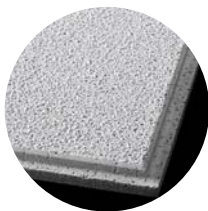
TEXTURA Beveled Tegular Edge