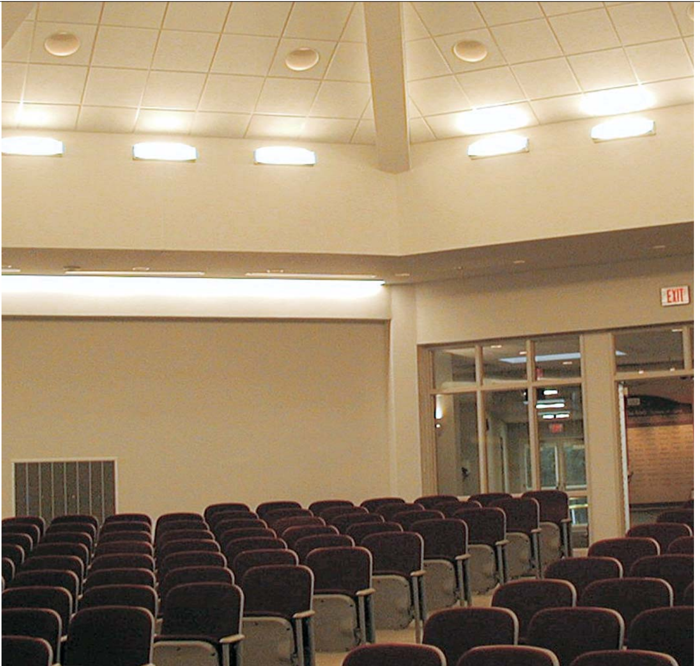
OPTRA Open Plan Square Lay-in with Peakform 24mm Exposed Tee grid