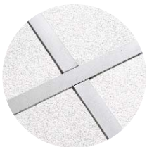
OPTRA Square Edge with Peakform 24mm Exposed Tee Grid