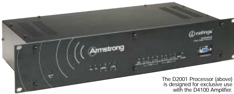
The D2001 Processor (above) is designed for exclusive use with the D4100 Amplifier.