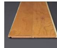
and you're done.

*Based on hardwood installer labor rate of $18 per sq ft and carpet installer labor rate of $3 per sq ft